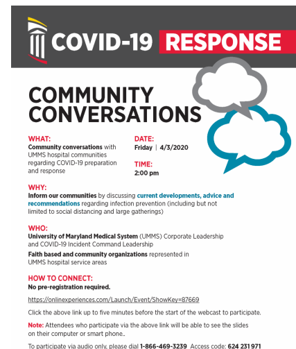
Image: Community Conversations Flyer

To participate via audio only, please dial 1-866-469-3239 Access code: 624 231 971