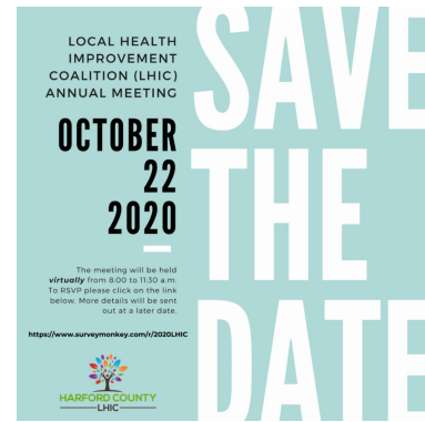
Image: Annual LHIC Save the Date Flyer