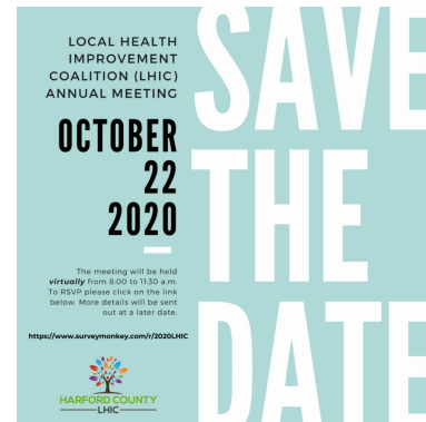
Image: Annual LHIC Save the Date Flyer