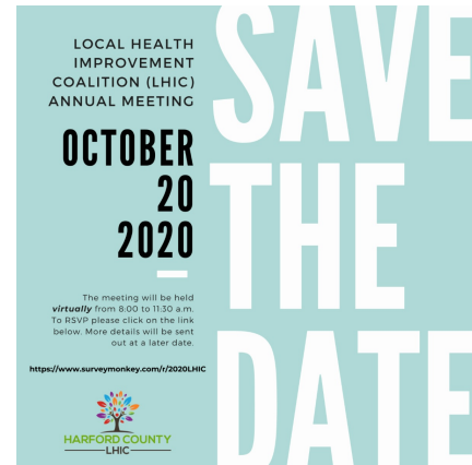
Image: Annual LHIC Save the Date Flyer