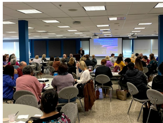
Image: 2019 LHIC Annual Meeting

You can view the main LHIC webpage here .