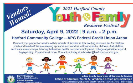
Image: 2022 Harford County Youth & Resource Festival

Vendors are needed for this event. To learn more, click here .