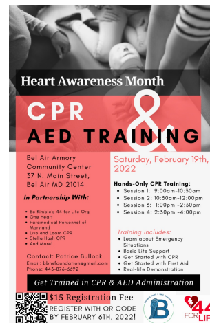
Image: CPR & AED Training

Registration is required. To learn more and to register click here .